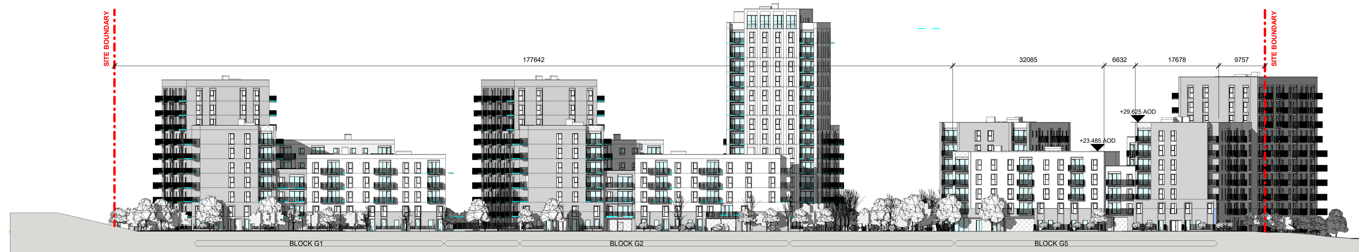
1 Elevation AA 1 : 500