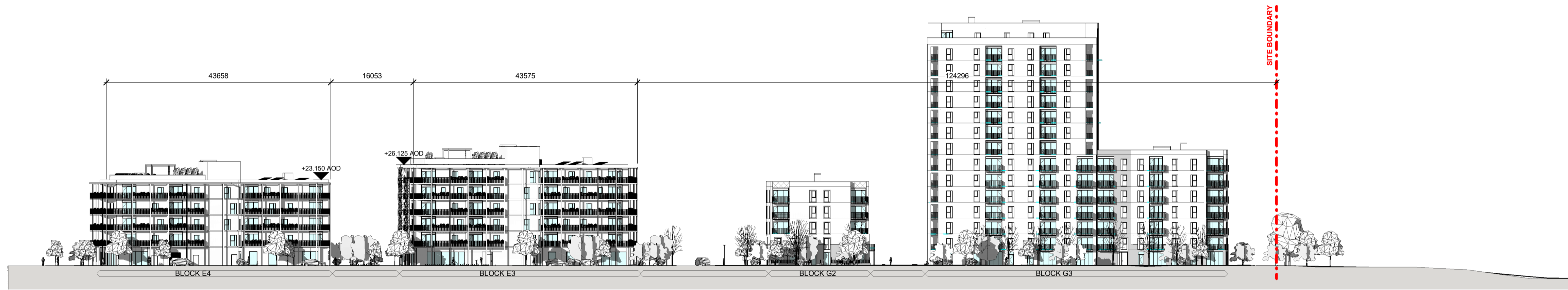
2 Elevation BB 1 : 500